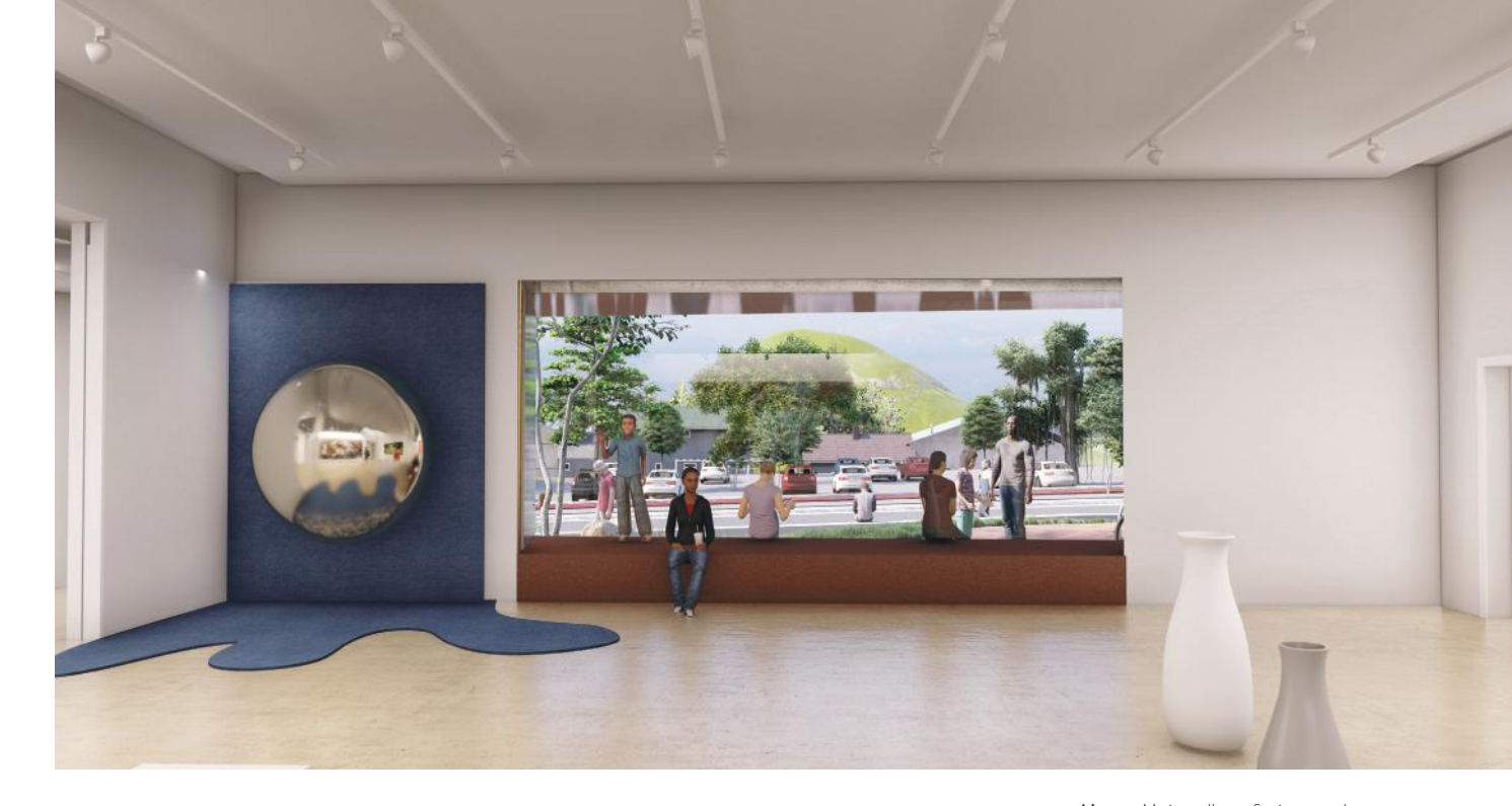
Above: Main gallery, facing north.

The new Main Gallery realises the true potential of the historic BVRG footprint, opening up the space and removing existing office space, interruptions in walling materials, and structural anomalies that interfered with sight lines. The Main Gallery grows into a state-of-the-art modern exhibition space with a ceiling height of 4 metres additionally augmented by three sky wells that extend further upwards and lend rich difused natural light. The latest in museum quality lighting and environmental control ensure works are safely exhibited. Access to the loading dock and art storage/preparation areas are thoughtfully placed, ensuring the greatest flexibility for diverse and physically challenging artworks to be included in exhibitions.