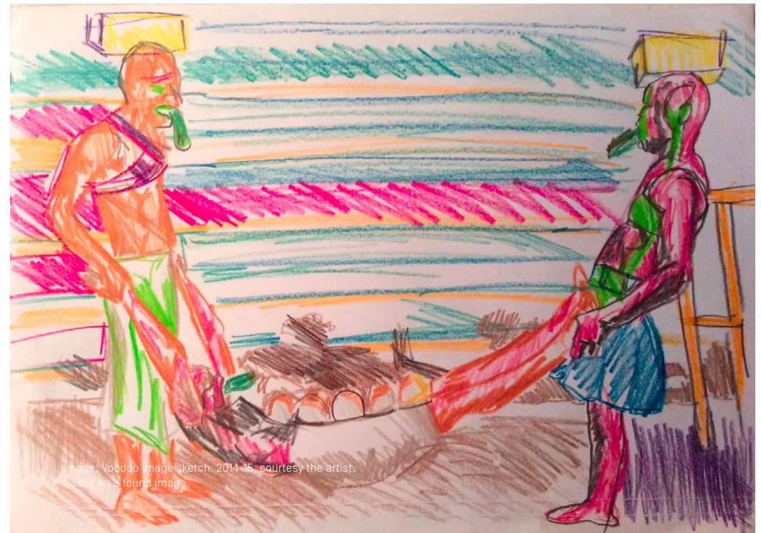
Image: Voodoo Image/Sketch, 2014-15, courtesy the artist, based on a found image

Of course when I went to art school, they taught us about Duchamp... but the readymade really is about everyday objects that we live with, and I think you can imbue other meaning